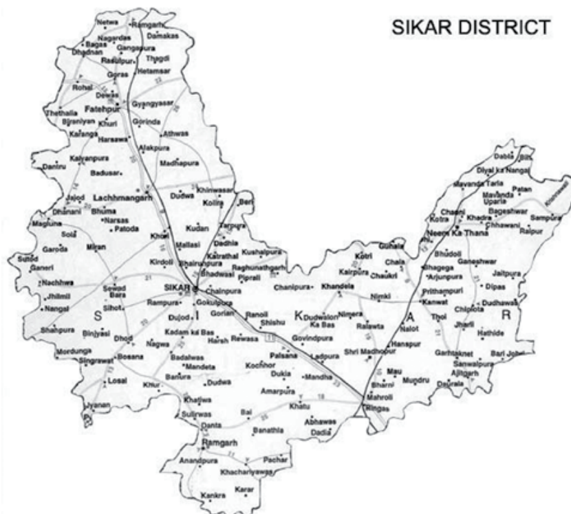
Fig 1. Sikar district map